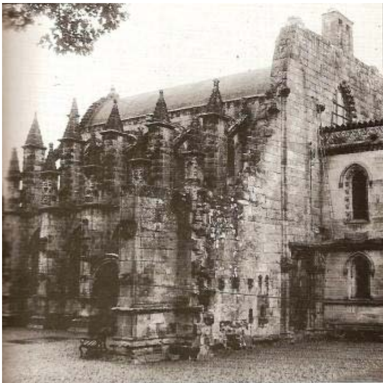
Exterior of Rssslin Chaple